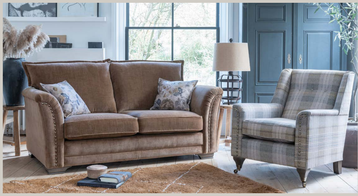
2 seater sofa (standard back) in fabric 4628, small scatter cushions in 4123, antique ash feet. Accent chair in fabric 4273, antique ash/antique brass castor legs (ACO2). (All items shown with optional antique studding).