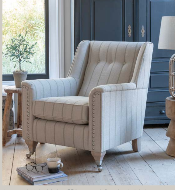
Accent chair in fabric 4550, grey ash/brushed nickel castor legs (GC01). (Shown with optional pewter studding).