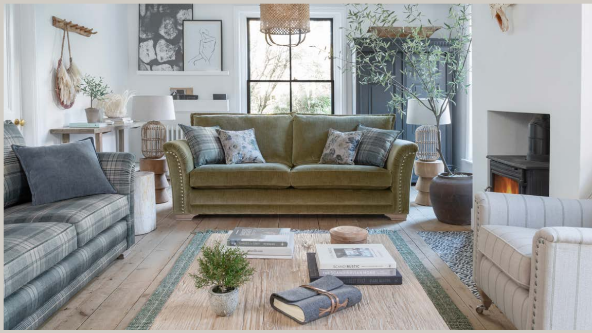
3 seater sofa (standard back) in fabric 4277, large scatter cushions in 4627, grey ash feet. Grand sofa (standard back) in fabric 4629, large scatter cushions in 4277, small scatter cushions in 4120, grey ash feet. Accent chair in fabric 4550, grey ash/brushed nickel castor legs (GC01). (All items shown with optional pewter studding).

wo pillow back cushions Two small scatter cushions