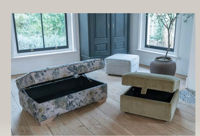
Ottoman in fabric 4120, grey ash feet. Footstool in fabric 4737, Storage stool in fabric 4629, supplied on glides. (Ottoman and stools are not available with stud option).