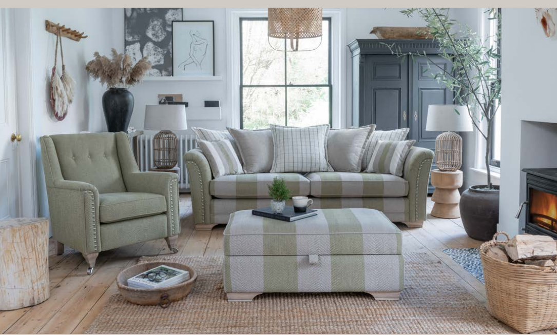
Accent chair in fabric 4910, grey ash/brushed nickel castor legs (GC01). Grand sofa (pillow back) in fabric 4660, 3 pillows in 4590, 2 pillows in 4918, small scatter cushions in 4470, grey ash feet. Ottoman in fabric 4660, grey ash feet. (Accent chair and Grand sofa shown with optional pewter studding).