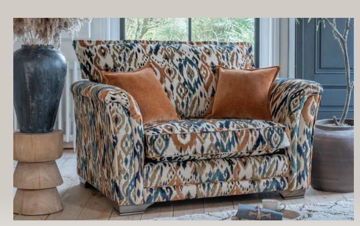
Snuggler in fabric 4040, small scatter cushions in 4626, antique ash feet. (Shown with 'no stud' option).