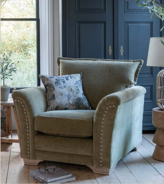
Chair in fabric 4629, small scatter cushion in 4120, grey ash feet. (Shown with optional pewter studding).