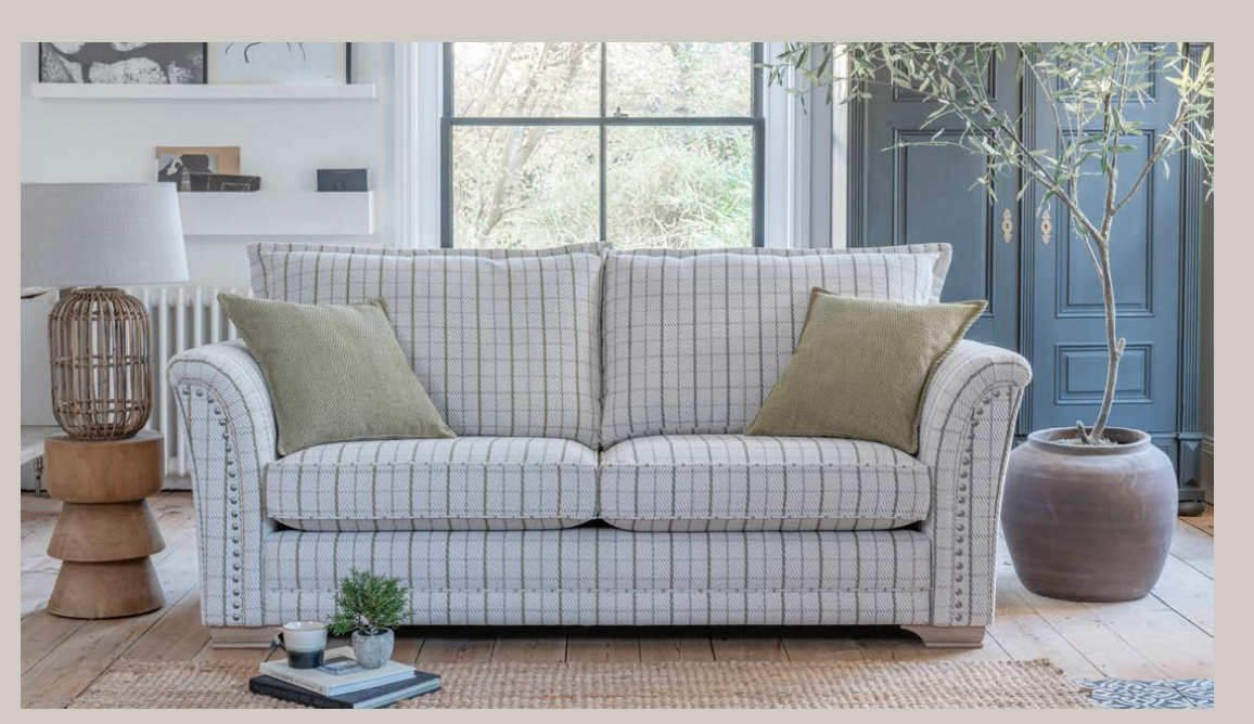
3 seater sofa (standard back) in fabric 4590, large scatter cushions in 4910, grey ash feet. (Shown with optional